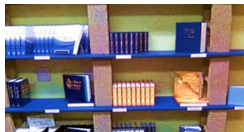
Come on inside to see the many selection of books, pamphlets, etc., that we have .