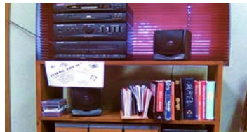
Check out the Library too, were there is a variety of DVD's, tapes, and books, etc. to check